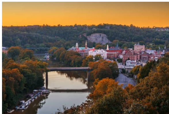
Frankfort = a city in Kentucky, USA

What if ... = What will happen if ... What if => Implied Conditional